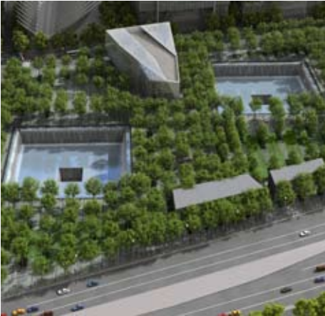
Aerial view of 9/11 Memorial. Rendering Squared Design Lab