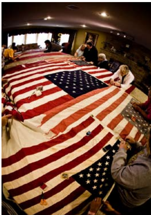
Promised gift to the 9/11 Memorial Museum.