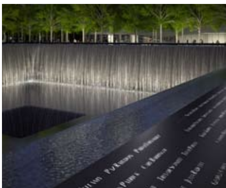
The Memorial names parapet at night.

Click here or visit www.national911memorial.org/artisticresponse to listen to a clip from an oral history with Michael Arad.