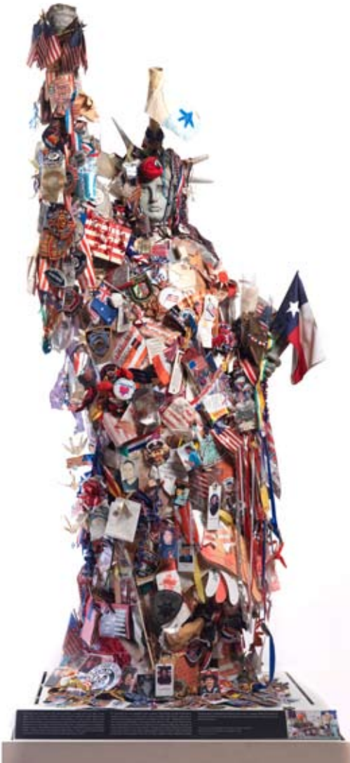
Gift in memory of the courageous firefighters from Engine 54/Ladder 4/Battalion 9 killed at the World Trade Center on September 11, 2001.