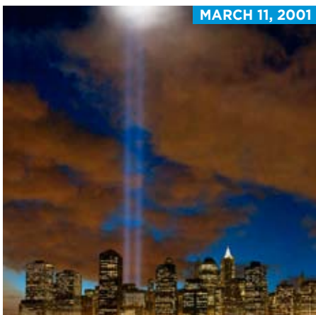
MARCH 11, 2001

SEPTEMBER 11, 2011: Dedication of the 9/11 Memorial.