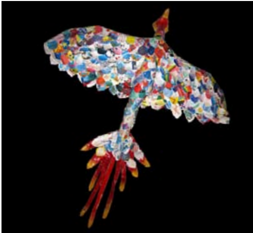
Feathers of the Phoenix.