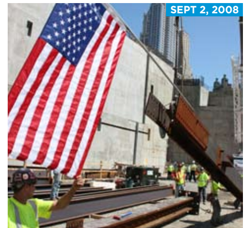
SEPT 2, 2008